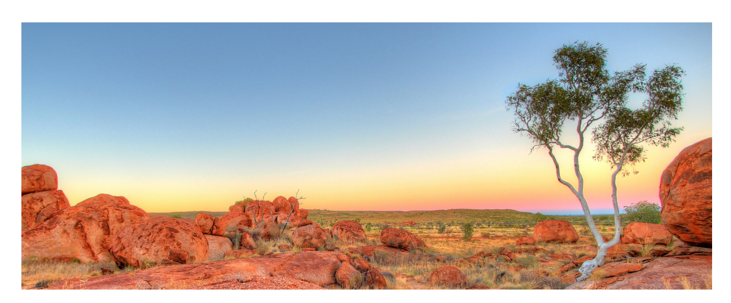
The Big Lie - White Settlement of South Australia and The Letters Patent