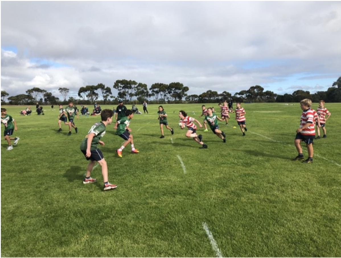
Our two St Joseph's boys' teams facing off in a tight game.